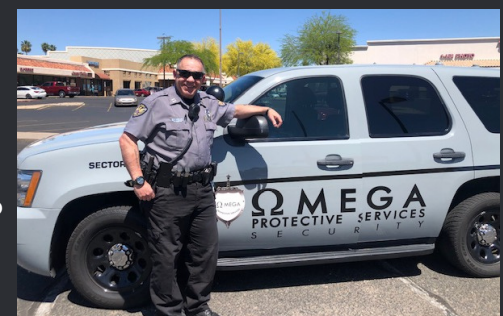
Omega Protective Services omegaprotectivesvcs.com

Program partners include: Quik Trip, Circle K, and Community Medical Services