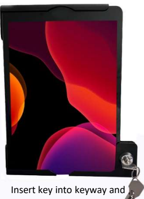
Insert key into keyway and turn counterclockwise (To the left).