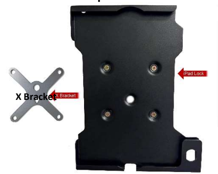
Mount the iPad Holder using the X bracket to the wall by drilling the 3"inch screw into a wood stud and 2"inch screws into the drywall or wall surface.