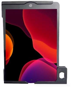
Slide iPad into the enclosure.