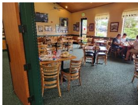
Views of Black Bear Diner, Oakley CA