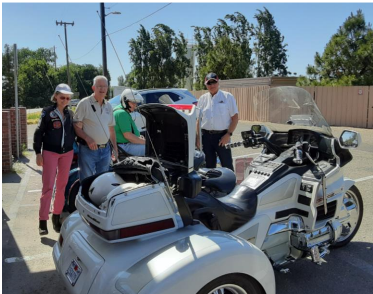
May 5 – Peter’s Steak House, Isleton