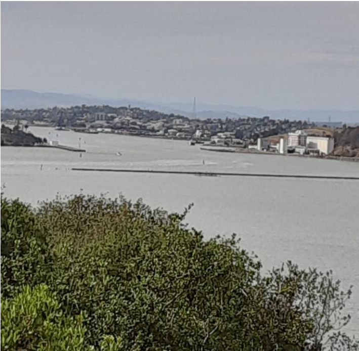
Views around Hercules, Crockett, Carquinez Bridge