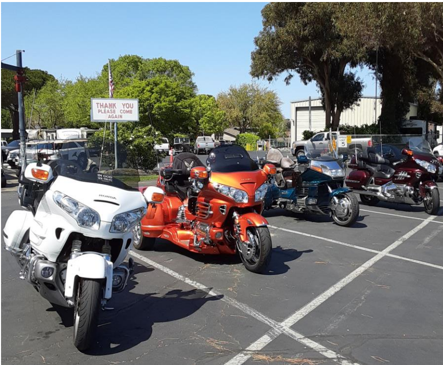
Motorcycles at a meeting