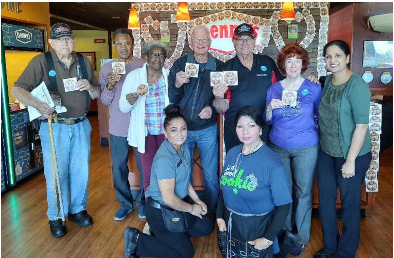
June 20, 2023 Meeting - Chapter P members hold their Cookies signs!