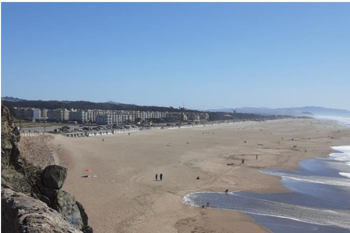
Old Playland area: Great Highway below