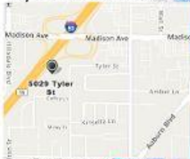
Taylor Street Church of Christ