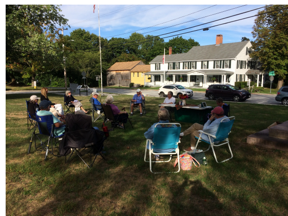
DCLT Annual Meeting was held outside and socially distant on Dudley Hill, September 12th