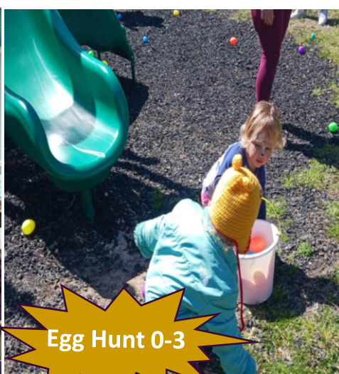
Egg Hunt 0-3