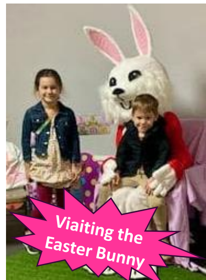
Visiting the Easter Bunny

Our WOTM Children's Easter Party 2024 -another fun day with our families! Lots of activities including games & lunch. Lots of fun had by all. Thanks to our many volunteers & the Moose 495 Kitchen staff for a fabulous lunch. Our Volunteer squad is growing, ask how you can help!