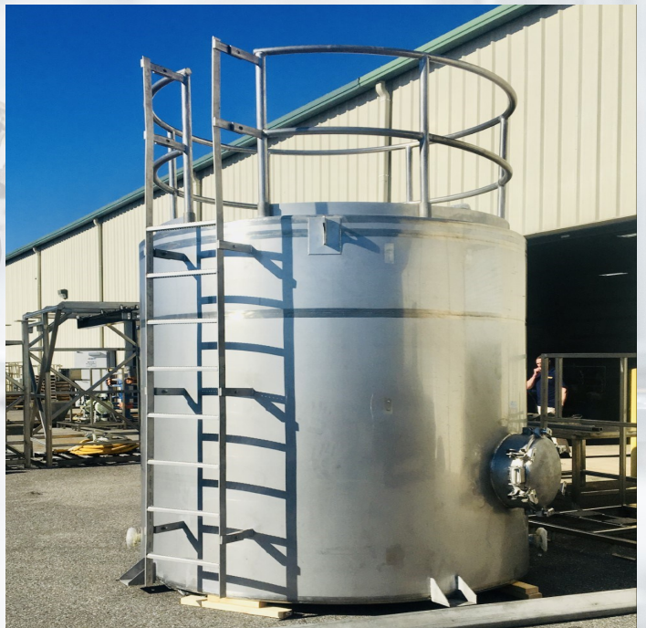
6,000 Gallons Capacity Storage Tank