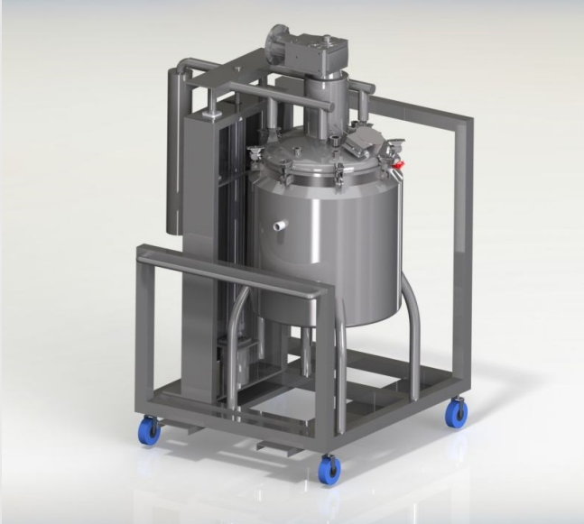
Jacketed Mixing Tank with Hydraulic Cover Lift Mechanism