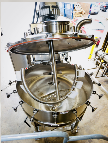
IA Inclined Agitator Kettle