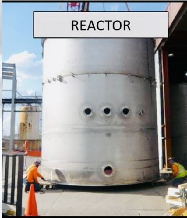
20,000 Gallons Capacity Reactor