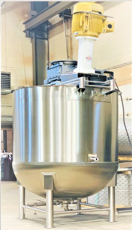
Twin Motion Kettle with Admix High Shear Mixer