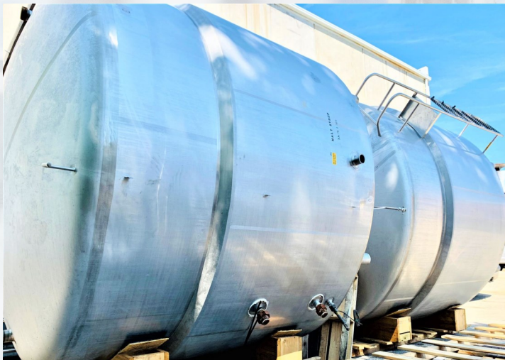
7,500 Gallons Storage Tanks