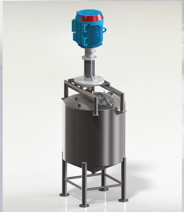
Single Motion Vertical Mixing Tank