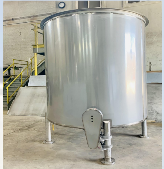
Mixing Tank with Side Entry Mixer