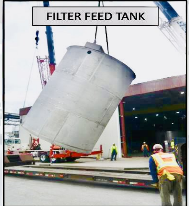
16,000 Gallons Capacity Storage Tank