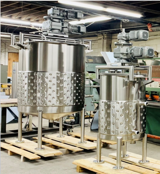
Twin Motion Jacketed Mixing Tanks