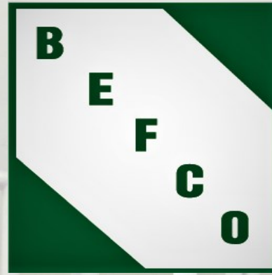
BEFCO Manufacturing, Inc.