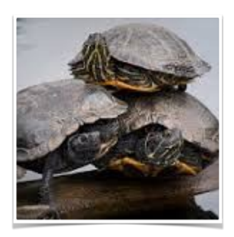
Doing Together What One Alone Cannot Do!

NOTE: All pets must either be leashed or kept in an appropriate container while in the city park as per city park regulations.