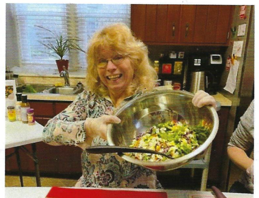
Cooking classes and art classes enjoyed.