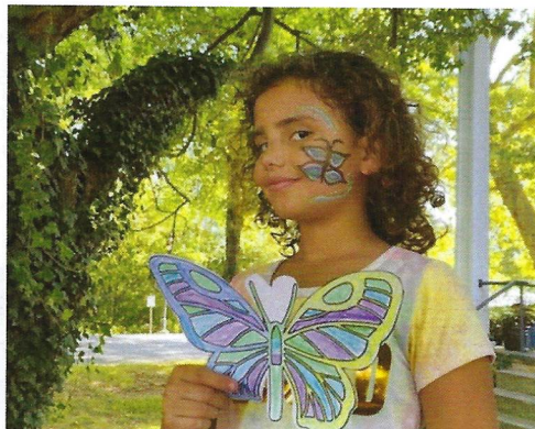
Remembrance events, including Butterfly Release, held annually.