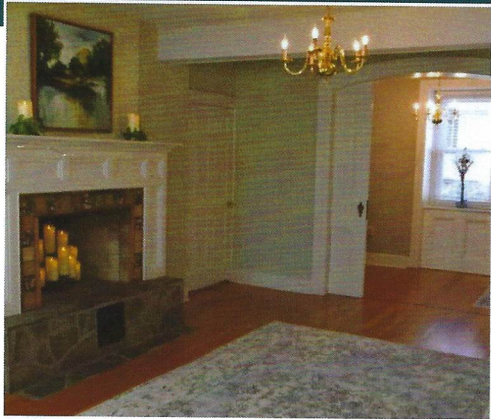
Gathering Room reception and meeting area.