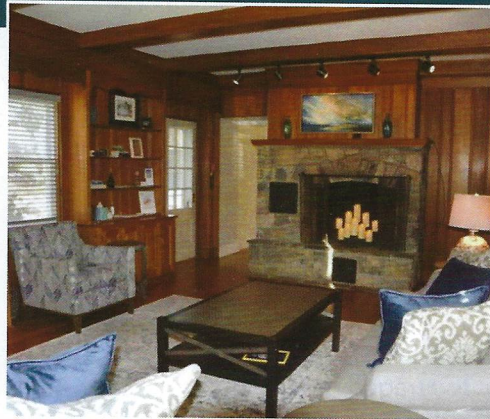
Library for meetings and conferences.