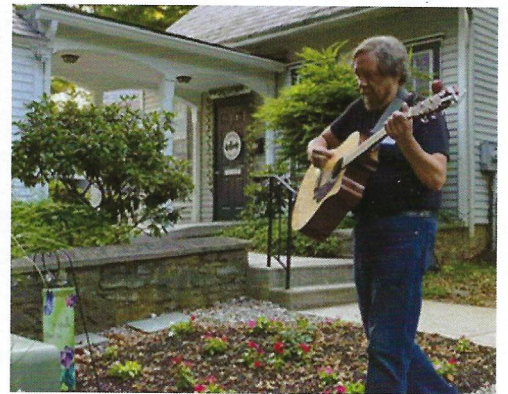
Musical entertainment, dinners, and social events offered.