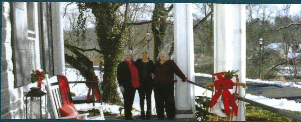
We welcome all to enjoy our Oasis!