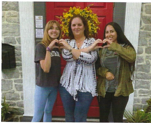
New friendships are formed.