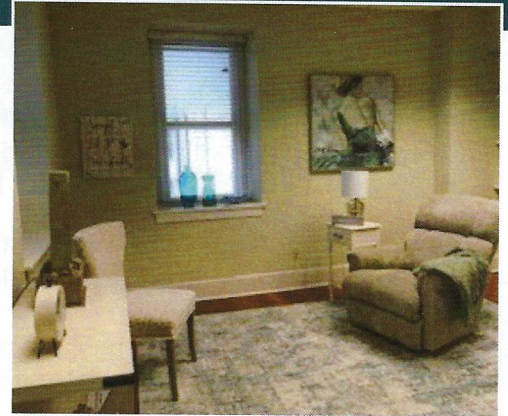
Serenity Room for relaxation.