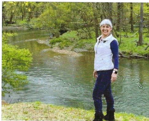
Guided walks offered along Oasis' creekside trails.