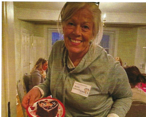
Volunteers help with events.