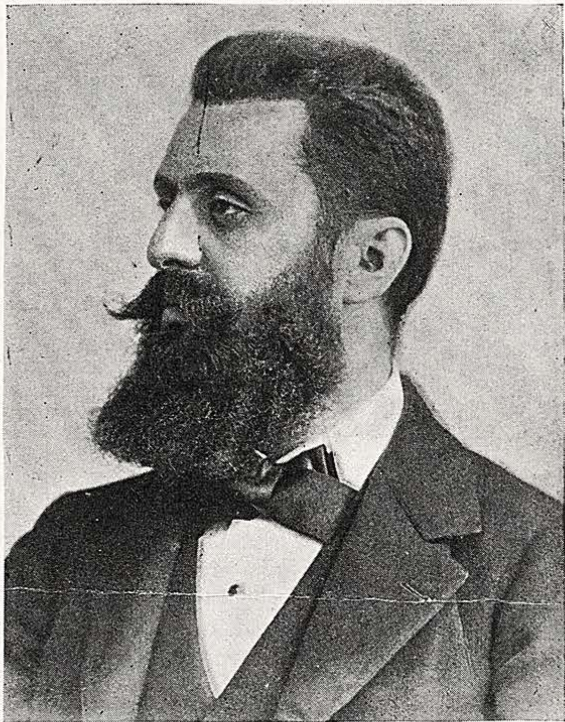
DR. THEODOR HERZL.

The former congress was convened in part in order that some estimate might be formed of the depth of sentiment in Jewry touched into life by the summons, "Let us journey back—in a higher sense, forward—to the land of our fathers." In so far, therefore, the gathering of a twelve-month ago was experimental in respect of its plans of organization, and limited in the scope of its deliberations. So pronounced at the outset was this feeling of uncertainty as to the outcome, and insecurity as to the consequences, that the Russian delegates not unwisely refrained from public participation in the debates, fearful lest their eagerness to assist in the rebuilding of the Jewish nation might appear treasonable in the sight of over-alert officials. One year had changed all this—in truth, one day, for ere the sun had set on the first day of the first congress a message had gone forth to the farthest ends of the earth, telling that this Jewish assembly, far from being an international conspiracy, was but the modern and popular expression of a noble and olden aim—the undying aspiration of the scattered remnants of a people to put an end