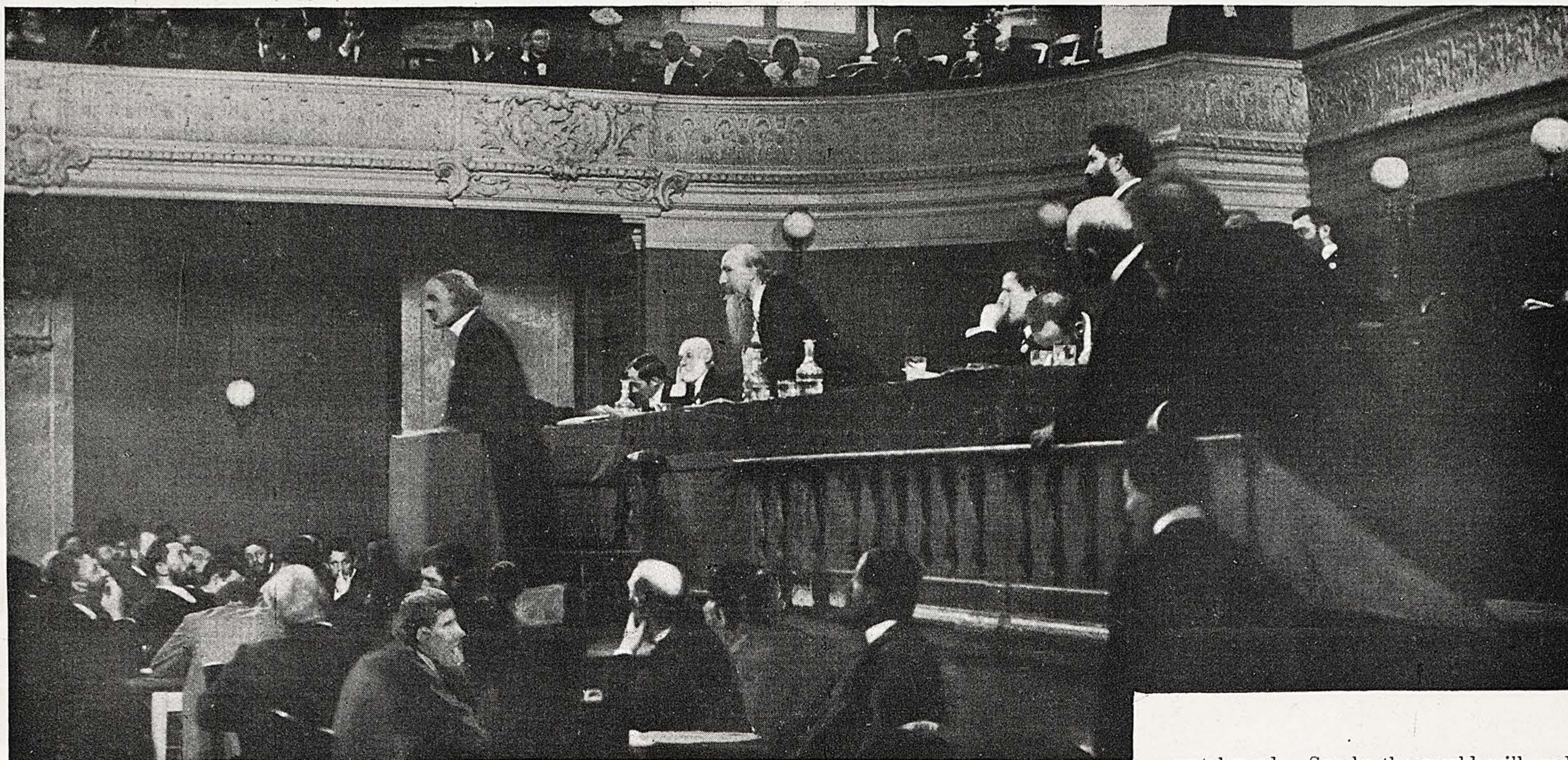
AT THE SECOND ZIONIST CONGRESS, BASLE, SWITZERLAND—SPEAKING FROM THE TRIBUNE.

stood with bowed head before the holy scroll of the Law; and as the "Vorbeter" chanted in a soft minor strain such passages as "Have Thou mercy on Zion, for it is the house of our life," strong men covered their faces and silently wept.