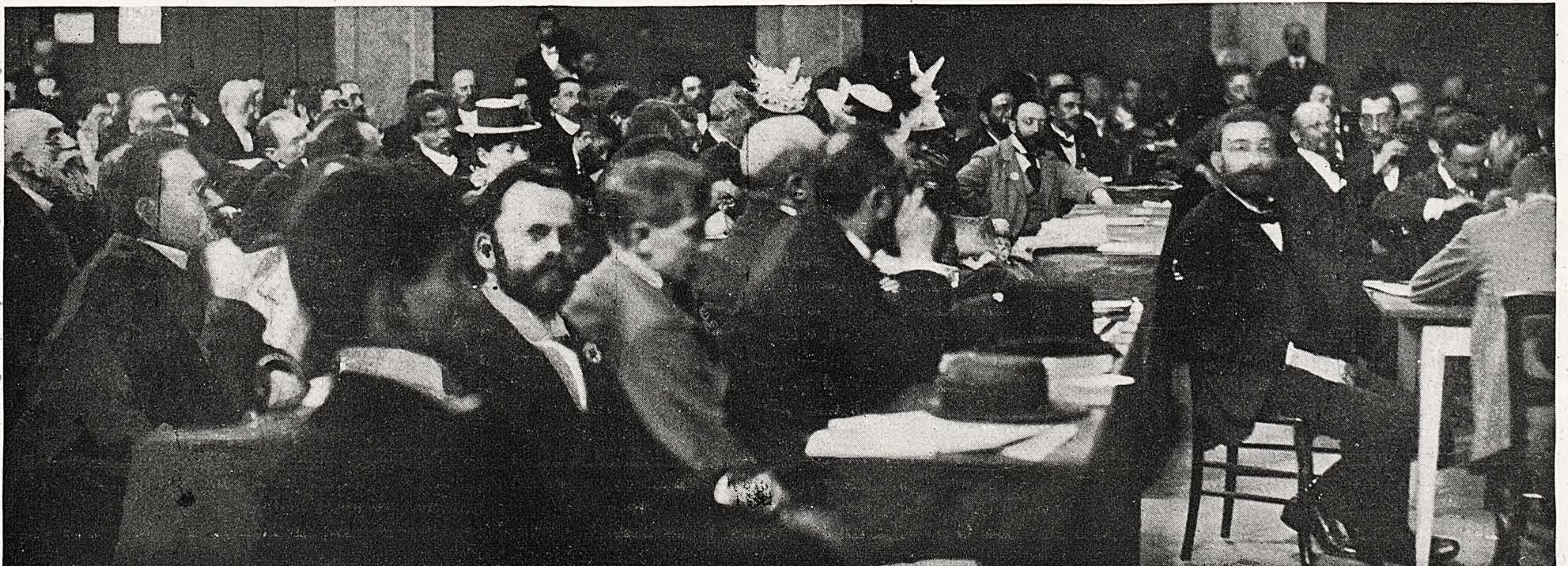
GROUP OF DELEGATES AT THE ZIONIST CONGRESS, BASLE.

On the Sabbath morning the stately synagogue of the town became the Mecca of the visitors. Favored, blessed shrine! Since last the pilgrims of Jerusalem offered up their prayers in the Temple of the Most High, no altar had sheltered such a body of worshippers, come together literally from the four corners of the earth. What rapt devotion! What tearful entreaty! What fervent thanksgiving! Within these walls there reigned no confusion of tongues, for the speech of the prophets and the sweet singers in Israel lived again. How these hosts thundered forth the Shemang Yisrael , Israel's ancient declaration of faith in the unity of God! Instinctively the congregation rose in reverence as Herzl mounted the altar steps and