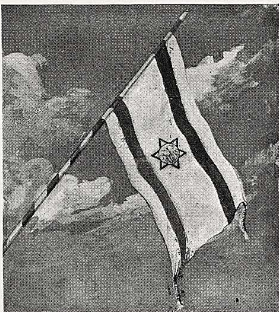
THE ZIONIST FLAG.

The results of the congress—who can accurately foresee at this early hour? We may, howbeit, confidently declare that a tremendous uplift has been given to the cause by the second Zionist congress. For one thing, Zionism has resolved that the immigration of foreign Jews into Palestine shall not be abetted or countenanced as long as the restrictive and prohibitive laws be not repealed from the statute-