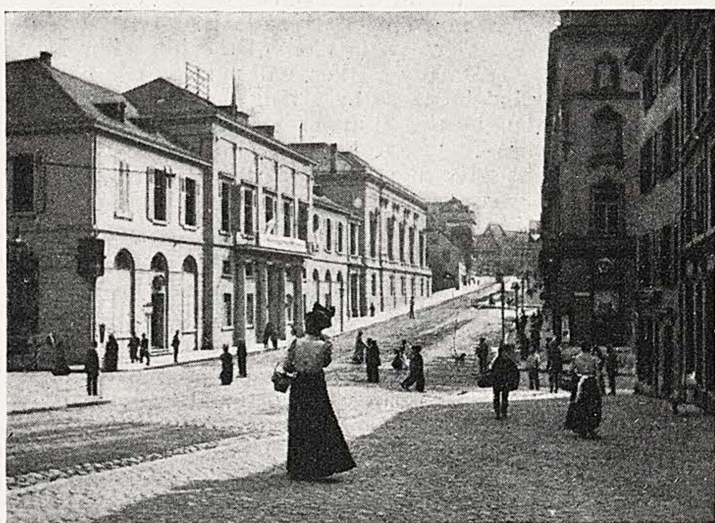
STADT-CASINO AT BASLE, WHERE THE CONGRESS MET.