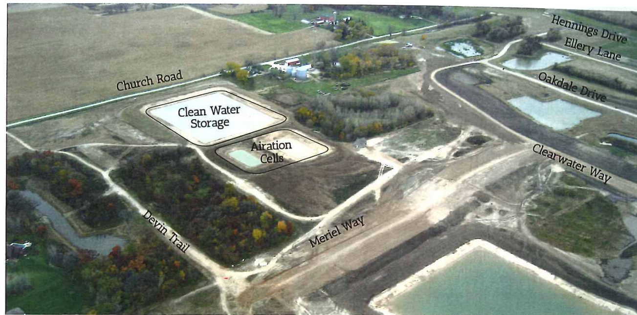
Waste Water Reclamation and Reuse System

At Henning Estates, we pride ourselves on being a conservation community. Nearly 60% of our entire community has been designated for the preservation and protection of ponds, wetlands, trees and prairie, providing a beautiful setting for you to build your home. With that at the forefront of our minds, we have chosen to invest in the cleanest, most environmentally friendly waste water management system in existence.