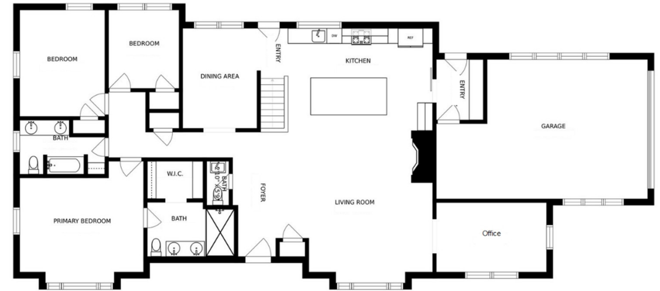
The Elizabeth Model 1800sq ft to 2600sq ft