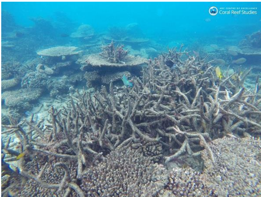
Dead staghorn coral.

(CN) — Efforts to restore coral reefs in the Florida Keys show promise to help some endangered coral from going extinct, according to research revealed Wednesday.