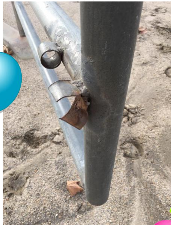
ALRC member Cary Westcott welding repair to a damaged gate latch