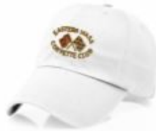
Richardson White Cap