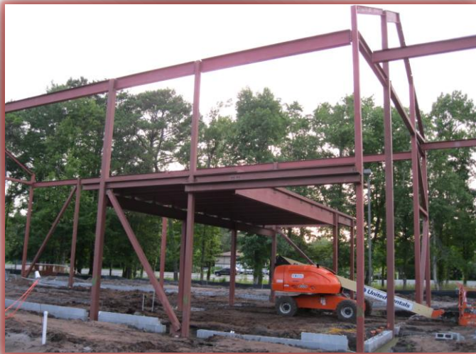
Teamway Builders, Inc. Holy Spirit Church 2016