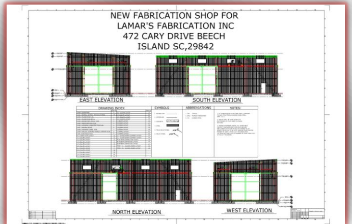
CAD detailing of Fabrication Shop