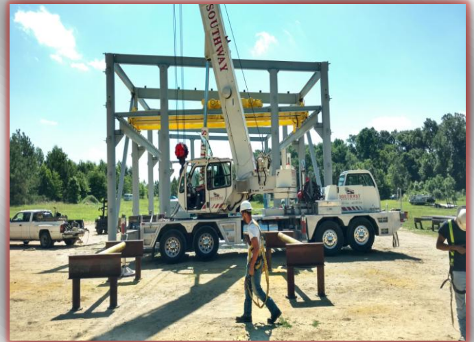
Lamar's Fabrication, Inc. Fabrication Shop 2017-2018