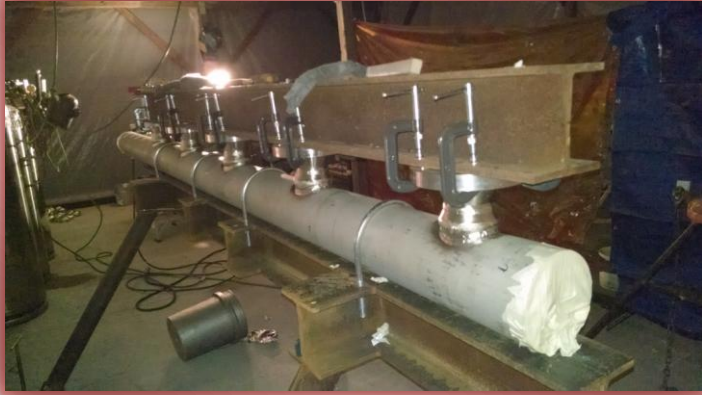
Continental Resources, Inc. Manifold 2015