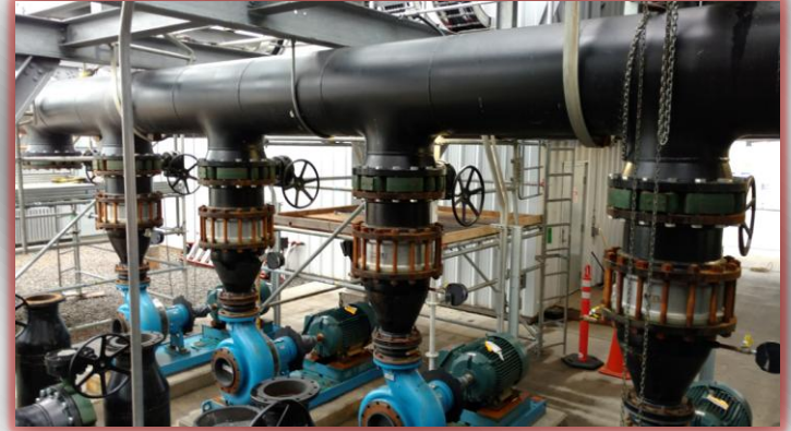
Elanco Chill Water Line 2016