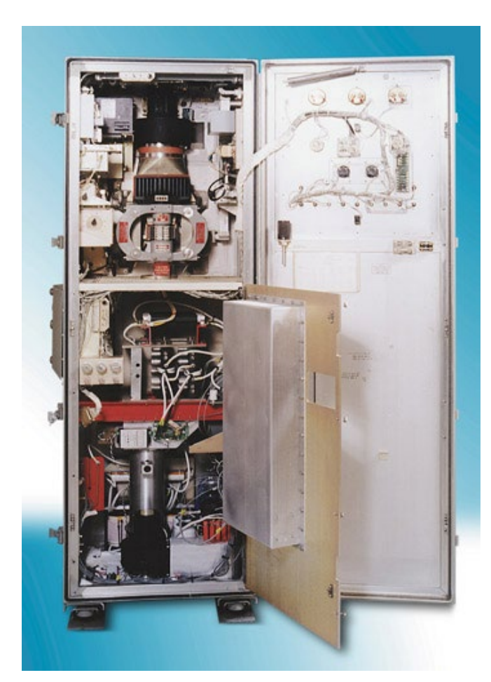
Figure 3. AN/SPG-60 radar cabinet. DTI's upgrade kit is installed in the lower compartment.

Solid-state transmitters increase the lifetime of VEDs. Most likely, this increased lifetime results from faster arc handling by the solid-state switch. Even in mod-anode and grid-pulsed systems, DTI uses a series cathode switch, which opens in <1 µs in response to an arc. The switch opens at relatively low current levels, and prevents the very high fault currents experienced in a transmitter during a typical crowbar. Eliminating these high currents (and their resulting fault energy levels) seems to be a critical element in extending VED lifetime. The opening of the series switch does not discharge the capacitors, or fault the power supply. The transmitter is able to resume operation as soon as an arc clears, as fast as milliseconds, often before the next pulse. From an operational point of view, this translates to significantly increased up-time. In summary, combining VED RF amplifiers and solid-state modulators and power supplies is a proven means to build highly reliable high power transmitters. It is possible that the reliability of a solid-state VED transmitter may be limited solely by cathode depletion.