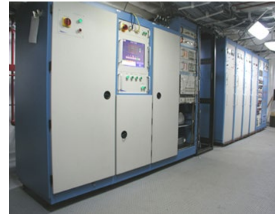
Figure 2. Cobra Judy X-band installation on board USNS Observation Island.

transmitter, which had originally been the major source of problems in the entire system, has ceased to be a cause of system down-time since its upgrade.