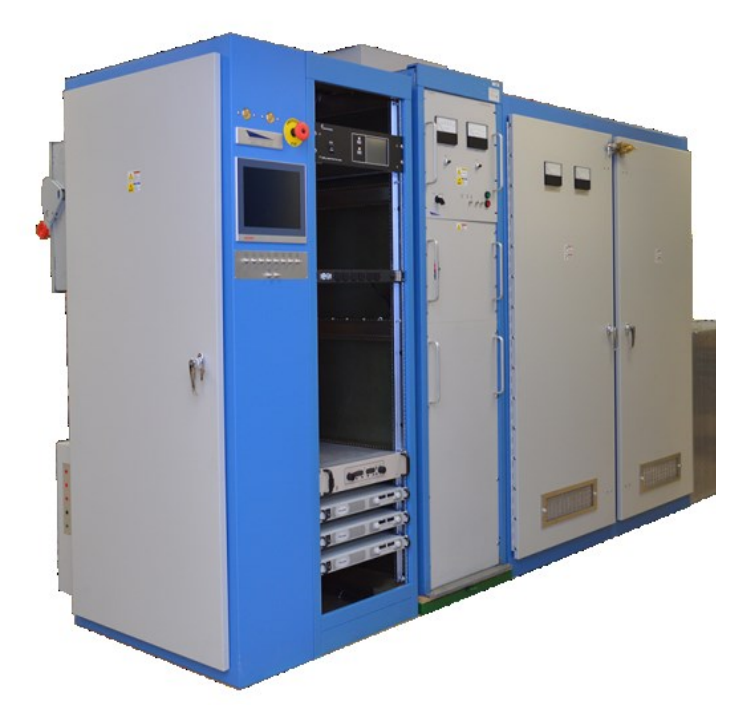
Fig. 1. Complete Klystron Test Stand, showing controls and auxiliary supplies in the left cabinet (Cabirack), the high voltage power supply (center-left), the high voltage modulator cabinets (center-right), and stand (right).

A co-located 19" rack contains the 480V/208V step-down transformer, HV body supply, solenoid power supplies, and the Vac-Ion power supply.