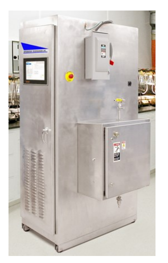
Figure 4. DTI Laboratory PEF System.

The substantive level of research on PEF for non-thermal processing has failed to drive commercial adoption. As discussed above, the primary barrier to adoption are not cost, performance, equipment availability, or even regulation. It is the fact that all of this research has not provided a well-defined roadmap for a company that is interested in adopting PEF processing. In fact, reviewing the literature, even for a specific product, can show whether PEF is applicable, but will provide only limited indicators of the reauired process needed for parameters commercial implementation.