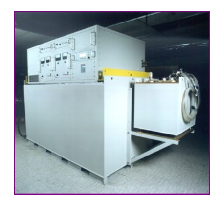
Figure 2. World's First Commercial-scale PEF System, built by DTI for the DUST Consortium in 2000.

counting the cost of transport of product to and from a tolling processor).