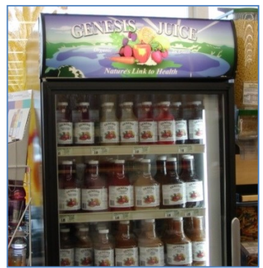
Figure 1. Genesis Juice on sale in 2007

The renaissance of PEF processing began after the crisis had passed, with the introduction of PEF processed juices by several companies in Europe around 2012. In most of these products, PEF processing was not used to achieve pasteurization (>5-log kill), but applied at lower doses to increase the shelf-life of fresh juices. This application appears