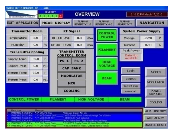
Figure 6. Screen shot of the transmitter overview touch screen control.

waveguide, fault protection, and cooling / air handling for the RF system. Controls and interlocks for the RF systems were integrated into the overall transmitter controls, discussed below.