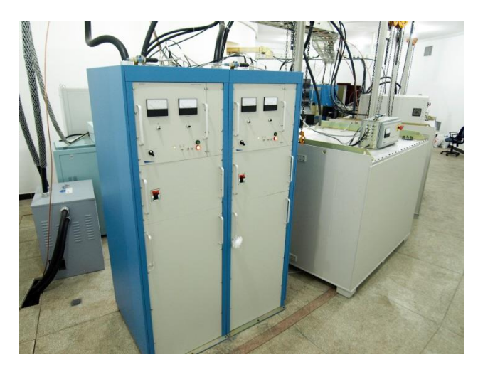
Figure 2. Installation of the 2 MW klystron transmitter. View shows DTI's high voltage power supplies (left) and capacitor tank (right).