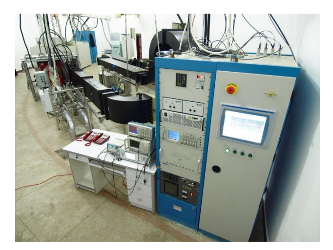
Figure 7. Installation of DTI's transmitter for a 2MW, 500 MHz klystron. Note the blue high voltage power supplies and light gray modulator tank in the far back, klystron, water manifold and black waveguide in the center and RF driver, microwave control unit, PLC and graphic interphase unit in the foreground.

The entire transmitter was successfully integrated and tested with CPI's VKP-8208A klystron at the customer's site in 2011, where it continues to operate today (Figure 7).