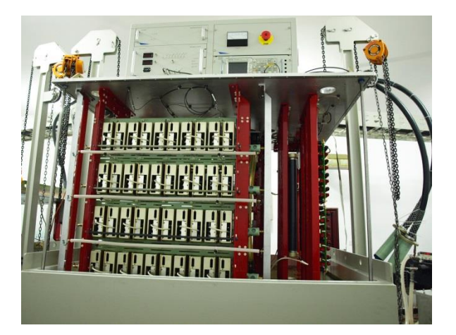
Figure 3. Switch plate array in the transmitter's modulator. The entire assembly is submerged in oil.

The delivered 2 MW Transmitter was a 'turnkey' system, including everything from facility power to the antenna waveguide. In addition to the power supplies and modulator driving the klystron, DTI specified, purchased, installed, and tested all of the RF components for the system. This included the RF driver, circulator, dummy RF load,