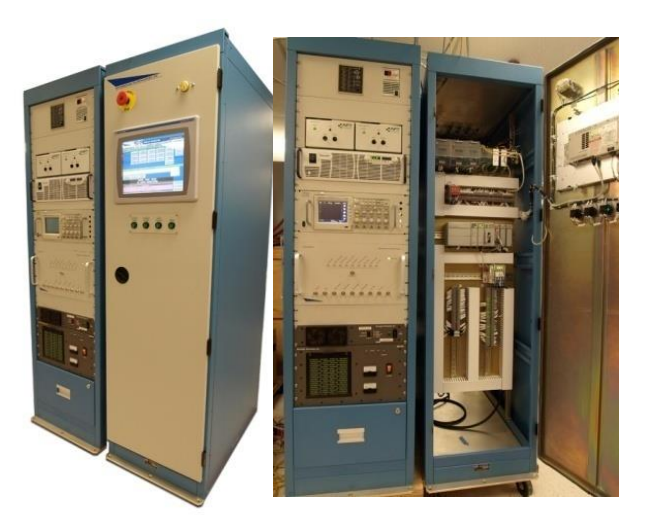
Figure 5. Controls racks for the 2 MW klystron transmitter.