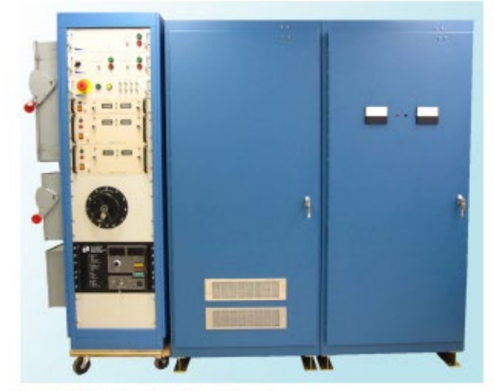
Figure 1. Switch Tube Test Set.

The test set is comprised of standard DTI subassemblies installed in several cabinets. In addition to DTI-supplied equipment, the test set system includes space for the tube