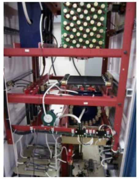
Figure 2. High Voltage Cabinet. Clockwise from top left: Switch Plate; Snubber Circuit; Grid and Screen Plates; Filter Capacitor; Storage Capacitor.

The grid switch circuit assembly (middle section of Fig. 2) is comprised of two solid-state switches, which modulate between the OFF and ON voltage levels. Both switches are triggered by a single inductive loop initiated in the grid switch chassis. The switch plates are reversed so that the inductive loop closes one switch and opens the other, preventing shoot-through across the two switches. The screen opening switch is inductively-coupled to the screen switch driver circuit. The screen voltage is shunted to ground, providing a path for reverse electron flow (screen emission).