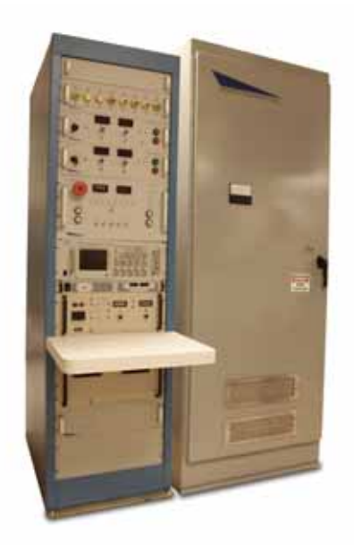
Figure 3. The control rack and high voltage cabinet of the tetrode test stand.

switch stack to protect the switches and the tube in the event of an arc. The inductor size allows the current to reach approximately 400 amps before the high voltage switch opens. Current sensors on the output of the supply recognize the presence of an arc when the current in the switch exceeds a preset fault threshold value, causing the switch to open in \sim 1 µs and disconnecting the high voltage from the load. After the arc extinguishes, the switch can resume operation in as little as a few milliseconds, instead of shutting down the system as is the case with a crowbar. This tube protection circuitry is tested through an automated system that introduces a short circuit through a length of 40 AWG wire. Sensors verify that energy limiting does not cause the wire to break.