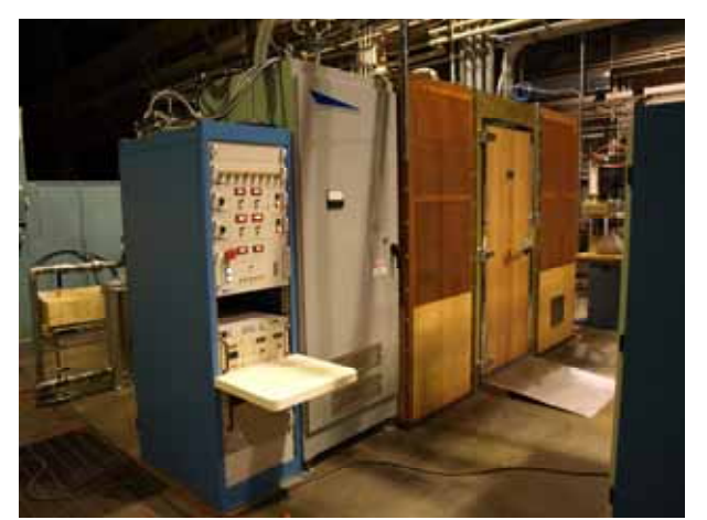
Figure 1. Tetrode Test Stand installed at Burle Industries.

The manufacturing and testing of RF amplifier tubes is complex. One of the key elements in this process is the initial tube operation (burn-in) and testing of the tube. During this initial period of operation, the test stand must be able to deliver a wide range of voltages, currents, and pulse parameters, in order to clean the tube of internal debris, projections, and out-gas. During this testing, it is critical that