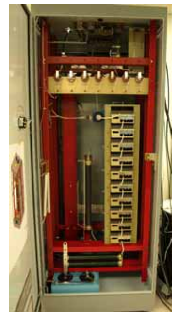
Figure 4. High voltage cabinet interior, showing the solid state switch (R), consisting of ten 3.3 kV switch modules connected in series.

Combining an opening switch and fast responding power supplies allows the hi-potting and high power burn in to be somewhat (if not entirely) combined. Faulty tubes, which would not operate in a crowbar equipped test stand, and could