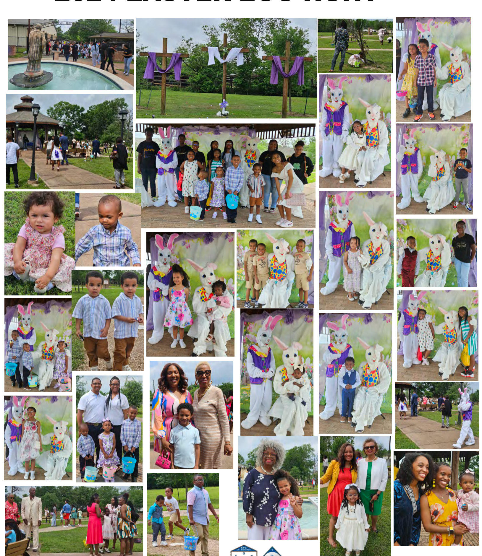
Parents, Thank you for your continuous support!