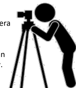
Bring your camera & take a picture with an Easter Bunny.