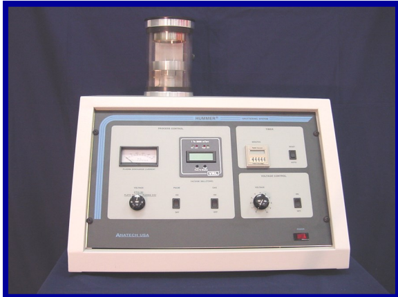
Hummer 6.2 Basic System