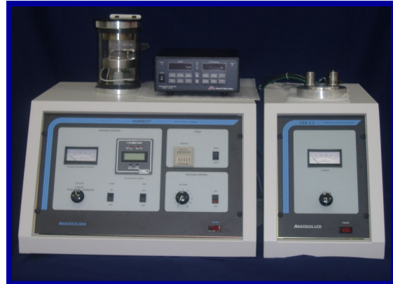
Hummer 6.2 with Carbon Evaporation Accessory and Thickness Monitor