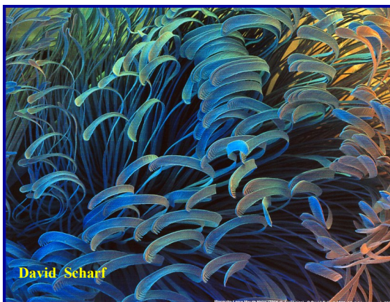
Mosquito Larva Hairs

SEM, R&D, FA, Materials Research, Medical /Biological Research and other Thin Film Requirements