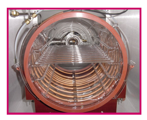
Inductively Coupled Plasma ICP