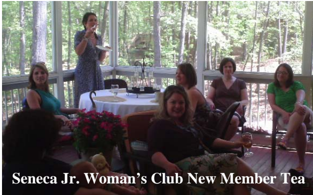
Seneca Jr. Woman's Club New Member Tea