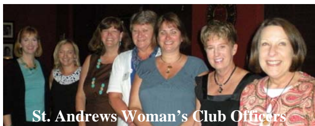
St. Andrews Woman's Club Officers