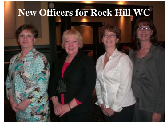
New Officers for Rock Hill WC