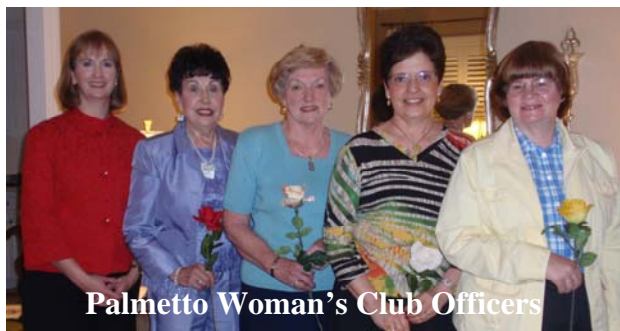
Palmetto Woman's Club Officers