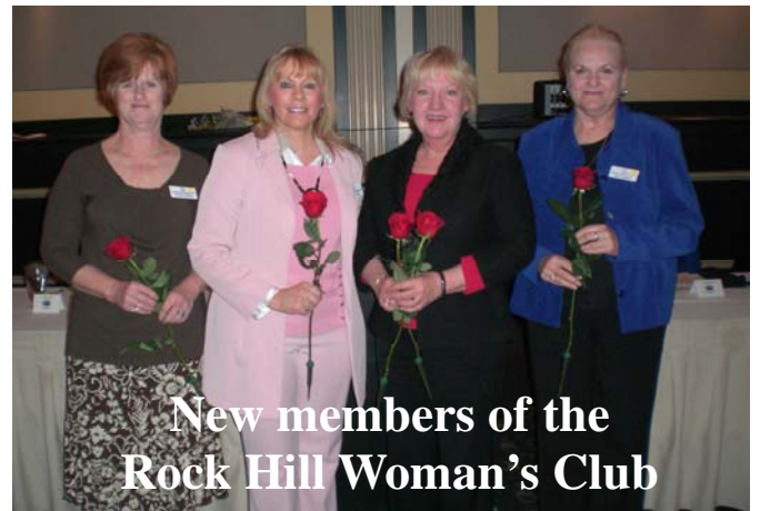
New members of the Rock Hill Woman's Club