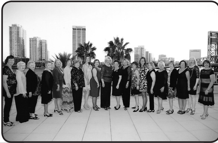
GFWC-SC Members at the GFWC Southern Region Conference October 21-23, 2016 Jacksonville, Florida