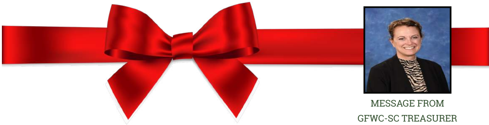
MESSAGE FROM GFWC-SC TREASURER