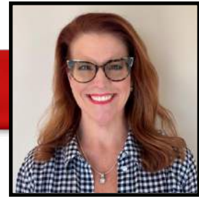
MESSAGE FROM GFWC-SC SECRETARY

I have enjoyed working with all of you this year and learning about the projects our clubs are doing in South Carolina. Attending the Southern Region Conference in Biloxi, MS in October was a great experience. I had the opportunity to meet GFWC members from throughout the Southern Region. I made new friends and enjoyed spending time with many of you also. It was a great time to learn, laugh, share, and make new friends. I look forward to seeing all of you again at our Winter Board Session on January 13, 2024.