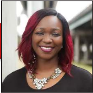
MESSAGE FROM GFWC-SC JUNIOR DIRECTOR