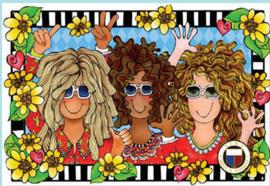
A Sisterhood of Service