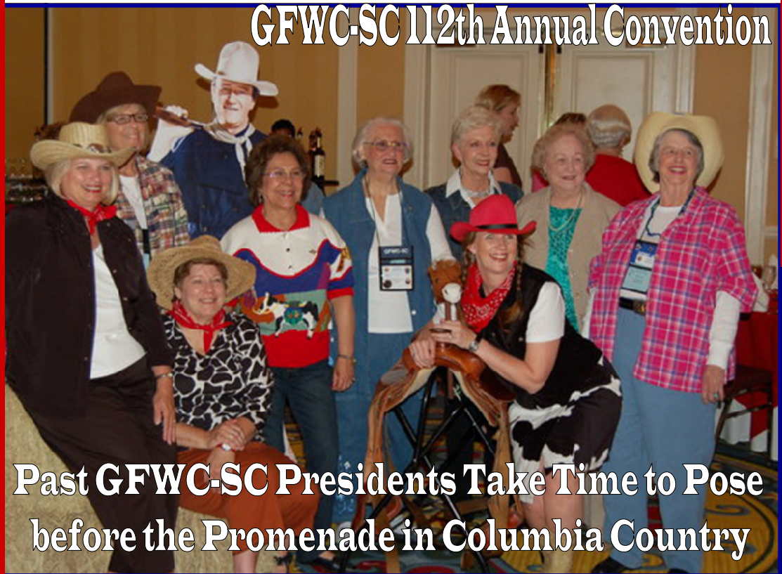
Past GFWC-SC Presidents Take Time to Pose before the Promenade in Columbia Country