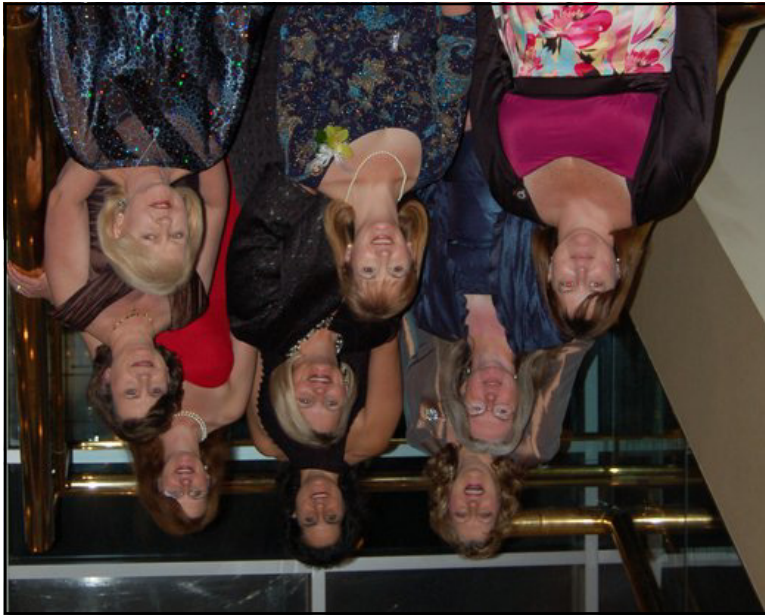
2010 - 2012 GFWC-SC Officers