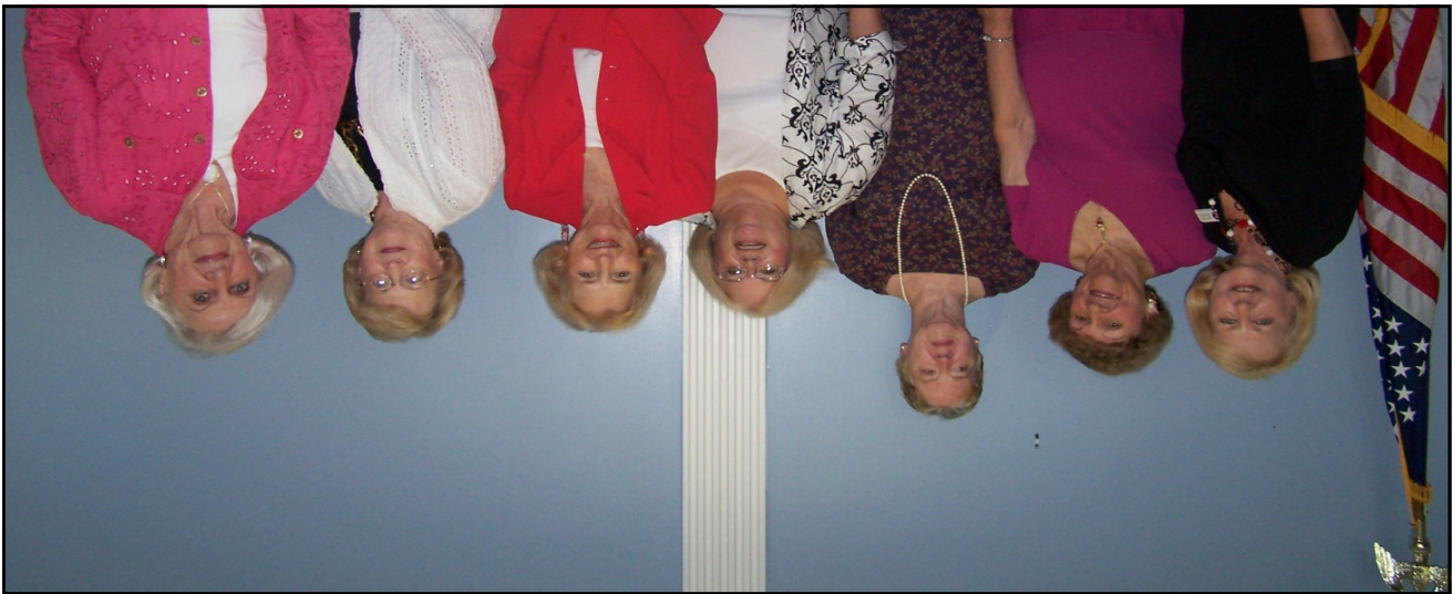
1st Vice President installs 2010-2012 Officers of the Woman's Club of Charleston in May, 2010

In 2002, she was selected as Woman of the Year, Charleston Federation of Women's Clubs and was one of fifteen women in a feature article on "Women of Charleston Making A Difference in Non-Traditional Workplace Roles" in the Post and Courier. She is a recipient of an outstanding student service award of the Charleston Higher Education Consortium and was honored by the Medical University of South Carolina with a bronzed plaque placed in the Harper Student Center recognizing her greater than 30 years of service to her colleagues and the students upon her retirement December, 2006. She has testified before the United States Senate on Financing Higher Education in America and is a Past President of the South Carolina Association of Student Financial Aid Administrators and served on numerous committees of the South Carolina Commission on Higher Education.