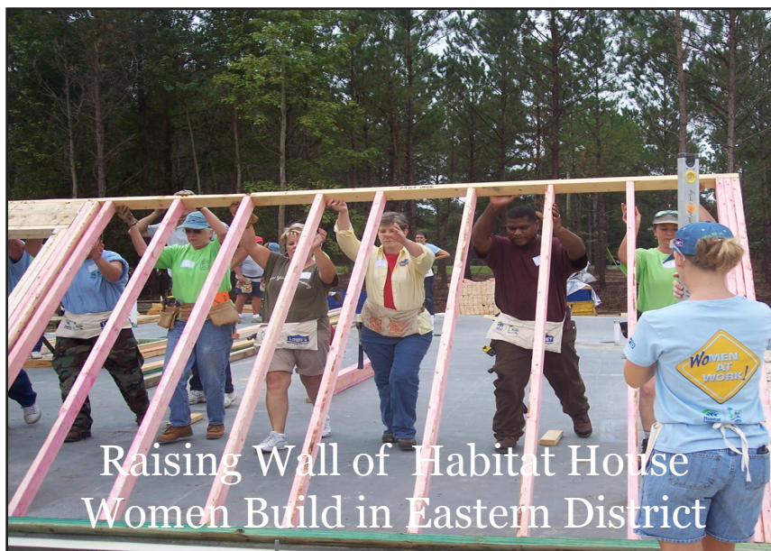
Raising Wall of Habitat House Women Build in Eastern District

2006-2008 GFWC-SC President's Special Project