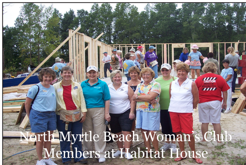
North Myrtle Beach Woman's Club Members at Habitat House

Member of the General Federation of Women's Clubs since 1898