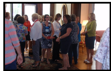
GROUP OF CLUBWOMEN