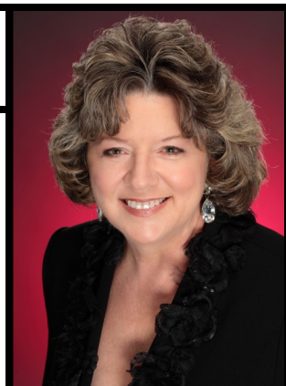
Lois Black Gold Star Plus White Circle