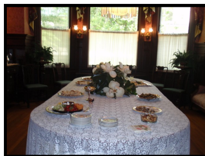
DINING ROOM TABLE