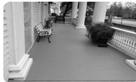
Finished Front Porch