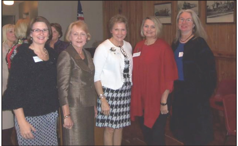
Walhalla Woman's Club 35th Anniversary Reception - January 27, 2013