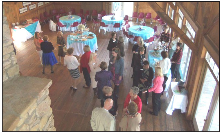
Easley Juniors Partner-In-Pride Beautification Project