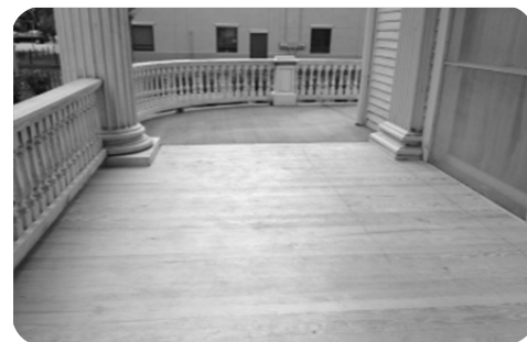
Unpainted tongue and groove treated boards