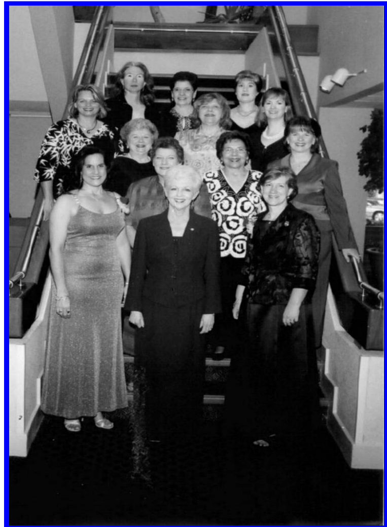
GFWC-South Carolina Delegation at International Convention