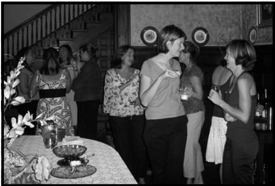
Junior Woman's Club of Columbia Membership Social