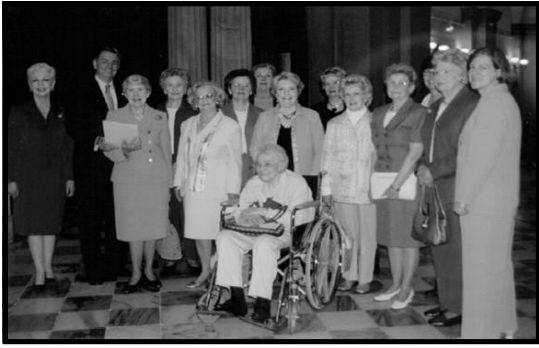
Woman's Club of West Columbia receive 100 year proclamation