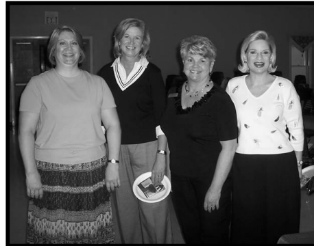
Women's Club of Fort Mill Ladies