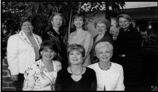
South Carolina Women in Denver