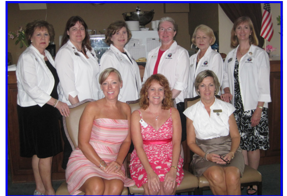
Eastern District Conference