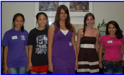
New club - GFWS-SC Three Rivers Juniorettes