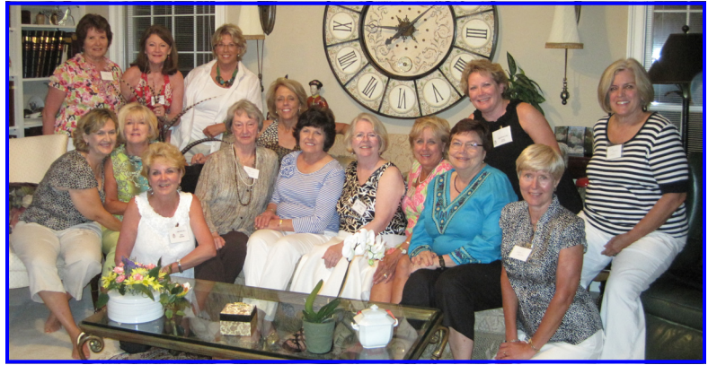
Chapin Woman's Club celebrated their 40th anniversary this summer!