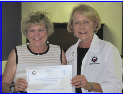
Woman's Club of Easley receives certificate for 85 years of club work.