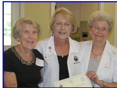
Woman's Club of West Columbia celebrates 105 years.