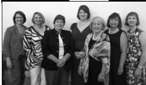
SC Delegation