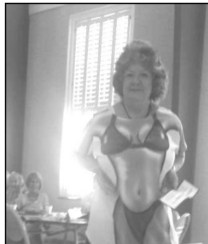
This is Your Life Skit