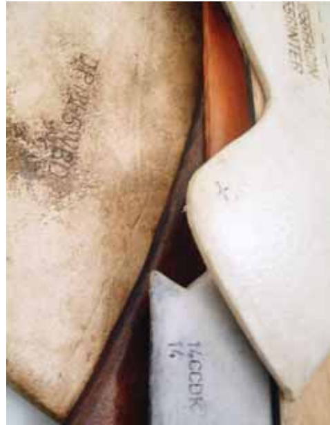
BOLLIHOPE SHIELD Mixed Media on six suspended and upholstered wood templates

eccentric and unstable. Even the articulations of hole and notches are oddly reassuring and familiar, although one is not quite sure why at first. These rather minor details are one key to how Atkin structures sculptural form, making sure that the smooth graceful curves do not become too abstract, but retain echoes of the everyday. Additionally, these articulations provide a sense of both purpose and incompleteness. Do other parts fit here? Are we waiting for them to be returned? Were they removed because unnecessary? Are we looking at the chassis (stand-in for the unadorned human body)? Or are we looking at the crucial aiming device or tongue to be fitted onto another chassis to guide it? Through the formal and narrative questions that Atkin raises here, we are pulled away a bit from Batman or Grimm's Tales, and brought into the orbit of the literature of writers like Samuel Beckett, Edward Bond and Maurice Blanchot. The menaces felt to be external - threat from that beyond one's control - and the menaces felt to be internal: anxiety, impotence, misunderstanding, and failure - perhaps beneath one's control - are related by Atkin, in a subtle understated manner