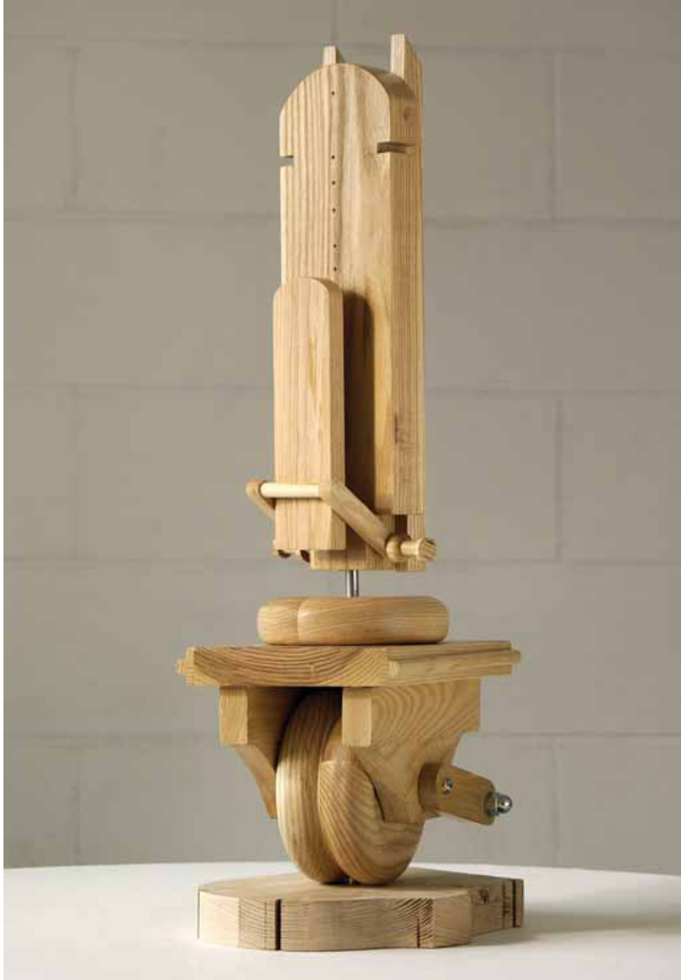
PORTRAIT OF DAL FABBRO (front view)