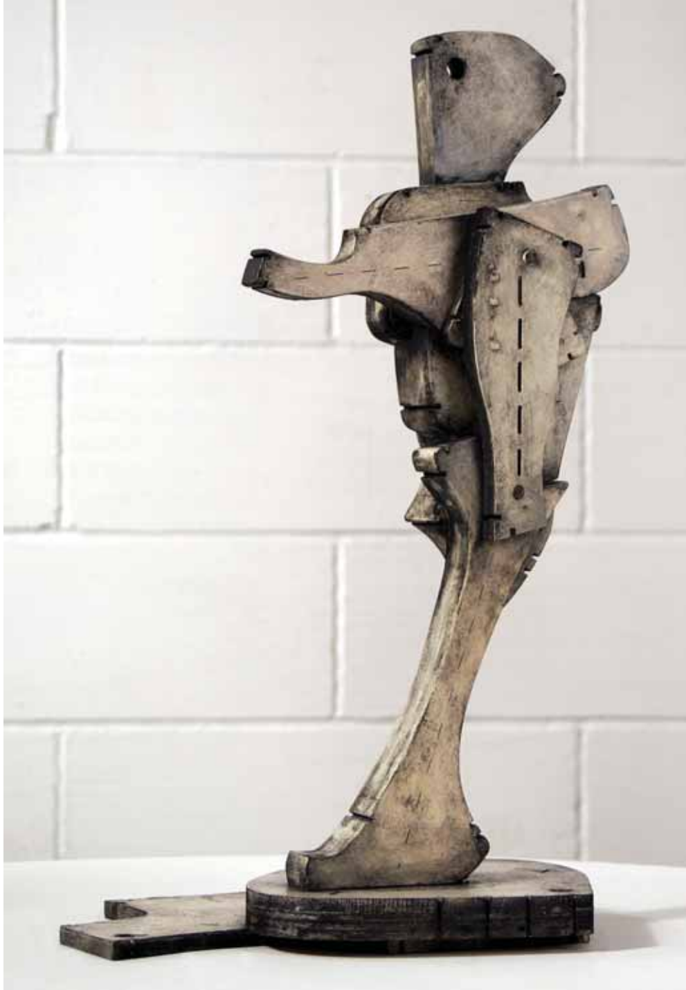
THE SIGNALLER (rear view) Painted Wood Height 67cm