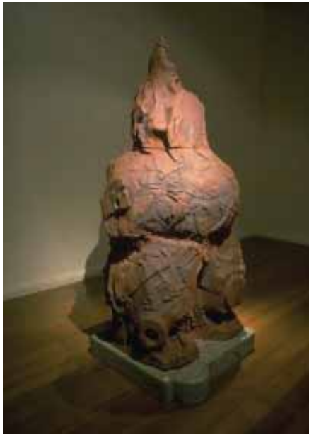
HOSTAGE 1990 Ceramic and found objects Height 180cm

The sculptures and drawings of John Atkin present not so much images of machines as they do diagrams of machines incompletely realized in our imagination. His playful inventions are casual and direct statements. And yet, like a well-written Tokugawa haiku - as opposed to a poorly written Elizabethan sonnet - they are metaphoric and rhetorical in the sense that they help us to discover our own metaphors in them, rather than impress us with the cleverness of the packaged rhetoric of their creator. They are not just literal observations, nor are they surrealistic details from one man's psyche, but more than anything else, they are complex metaphors simply put. Classical haiku frequently create parallels between states of nature and states of the human mind and human condition. Atkin's works explore how the human mind and the human condition are mirrored in the tools and devices that people make. And through this process these tools and machines are transformed into symbols and characters in the dramas of human experience.