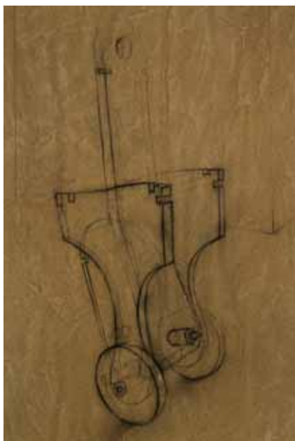
FLEEING FIGURE Mixed media on Ceramic Grog 82 x 53cm

Similar elements and events occur in the sculptures. While the interruption of one form overlapping another that occurs in the wall-hung pieces is not literally present in the sculptures, one feels the particular interruptions and exchanges between the shapes of The Navigator , with each other and with the surrounding space, as events related to those of the wall-hung series. The arc or bend of each edge and shape is responding. To what? To a missing piece? To the space needed for an arm or wheel to rotate? To a means of designing the element to have