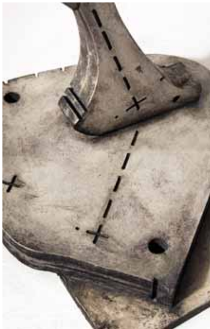
detail of SIGNALLER I