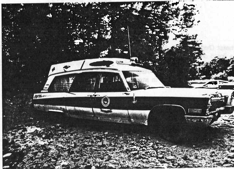
Presently out of service and sitting behind a New Jersey gas station is this 1968 Superior Cadillac 51-inch Rescuer ambulance. Car formerly owned by Glenwood-Pochuck First Aid.