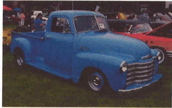
This attractively modified 1951 Chevy 3100 pickup earned Edward Laird the Best Truck trophy in the people's choice vote.