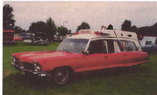
Rocket-shaped roof beacons were a nifty detail on Rich Litton's 1965 Superior Pontiac high-top ambulance from Moorestown, N.J.