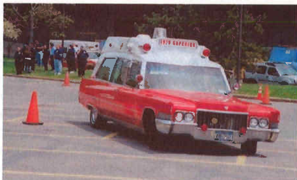
Dan Herrick's 1970 Superior Cadillac tackles the "Driver Challenge Obstacle Course" outside the N.Y. State Museum. As its 156-inch wheelbase was 18 inches longer than those of the Ford van ambulances used by other contestants, the pylons in the slalom were set further apart.