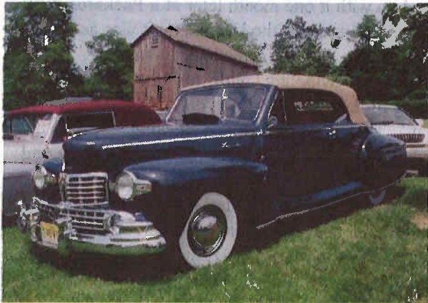
Bill Breitwiezer recalled that his 1948 Lincoln V-12 convertible, marketed as a Zephyr through the 1942 model year, was "just a pile of rust" when he purchased it in 1998. The restoration wasn't finished until Thanksgiving, 2004, but it was well worthwhile as only 1,241 were made from 1946-48.

a rare body style, with only 1,241 built from 1946-48." Being a retired body shop owner, Breitwiezer handled all of the restoration work himself except for the chrome and upholstery, finally dispatching it to the trim shop in January, 2004 for completion by the following Thanksgiving. "This was number 1,109 of 1,350 bodies," he also recalled, elaborating that "the difference between the number of cars and the number of bodies is due to 'misprints,' or misaligned bodies, that were scrapped at the factory along with the body number. Most of the 100-or-so bodies discarded were made in 1946 - all of the old Lincoln employees had gone to war, and some never came back, so the plant was on a learning curve."