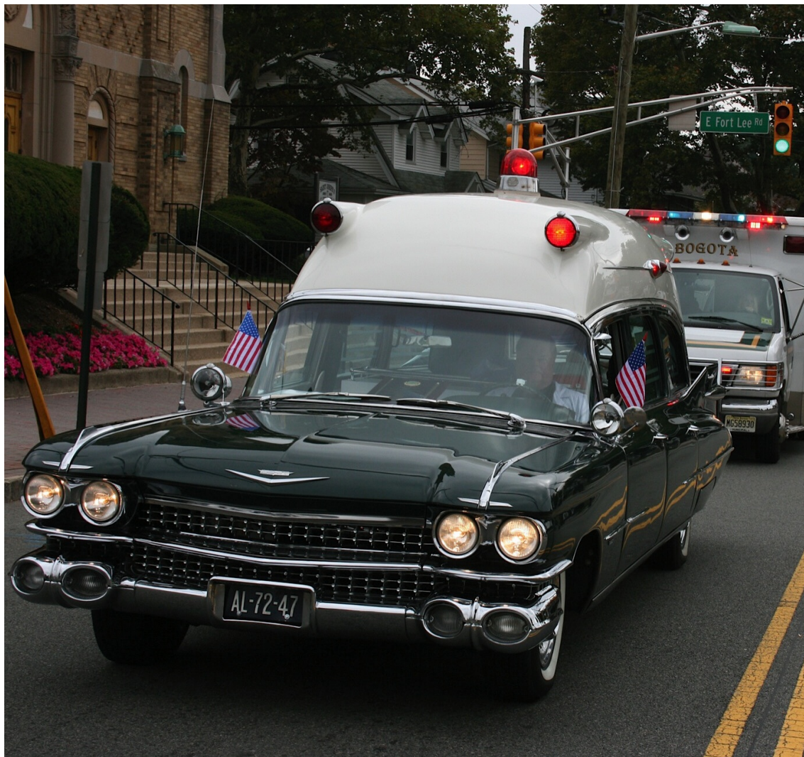
1959 Cadillac Eureka Returns to Bogota