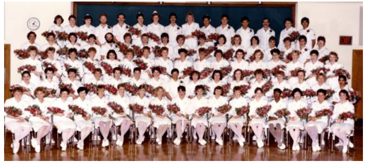
Class of 1991 - Celebrating 30 years!