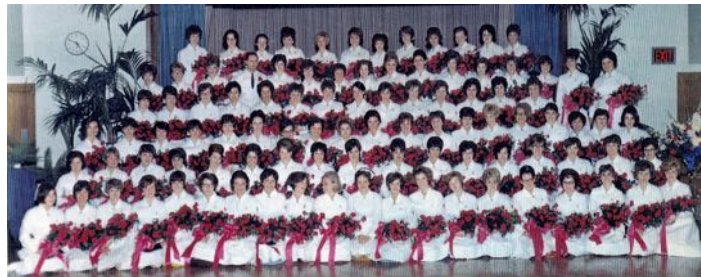
Class of 1971 - Celebrating 50 years! Our Jubilee Class