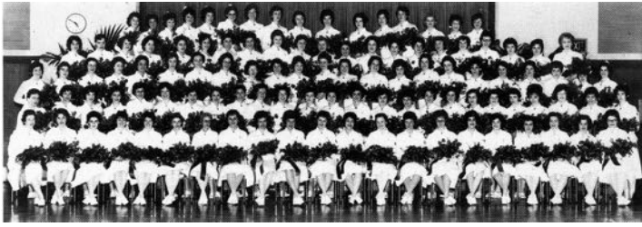
Class of 1966 - Celebrating 55 years!