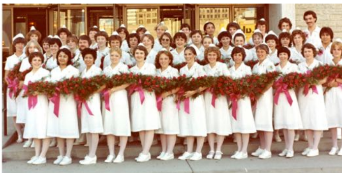
Class of 1981- Celebrating 40 years!