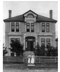
First Nurses' Residence 1888