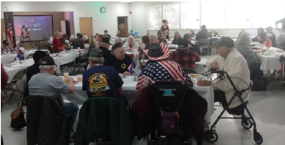
EDCFSC sponsored Veteran's Day Breakfast November 2023

Did you miss last year's great 2-day, free training to become a volunteer assessor in your Fire Safe Council? Providing knowledgeable, 1-1/2 to 2 hour home-specific assessments on both defensible space and home hardening can be an important impetus for residents to do effective wildfire preparation. To sign up for the training, contact Hugh Council . To request a free assessment of your own house/property, contact Carri Lueck