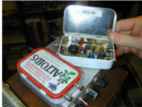
QRP low-power transmitter and receiver that fits inside an Altoids tin.

What is QRP? From Wikipedia, the free encyclopedia