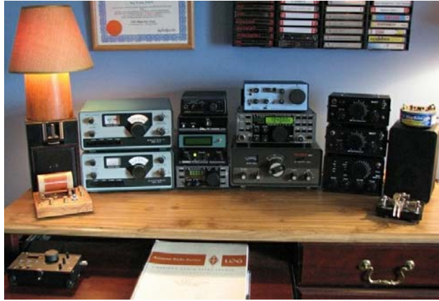
Picture of a nice QRP only station

Another comment is, if you are transmitting using 100 watts and a station says you are S6 in strength you need to double your power (200 watts) to increase a mere 3dB. To gain another 3db you again need to more than double (400 watts) your power. If the noise floor is setting at S6 and you can increase another S unit (6 dB) in strength it can make being heard or not.