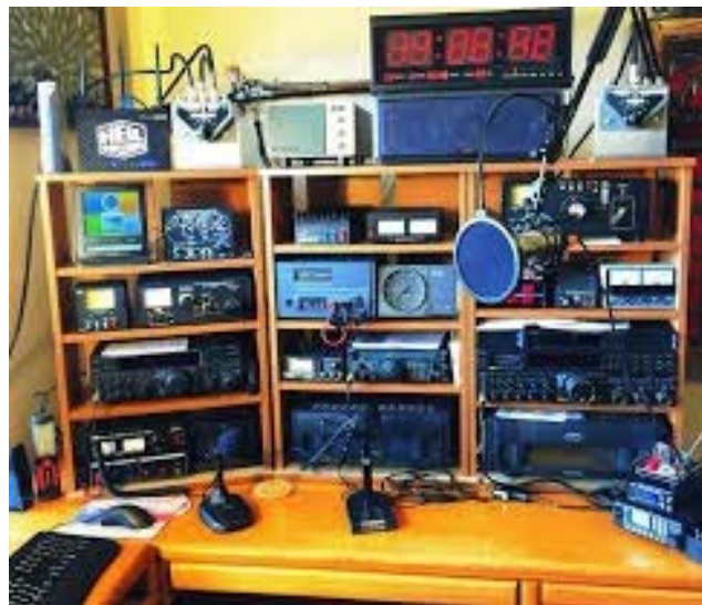
Picture of a nice QRO station

Key point is, there is a time for all and Ham Radio is a lot of fun to enjoy?