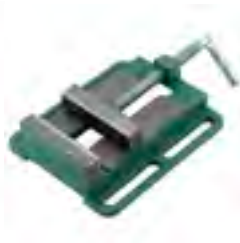
Small Heavy Vise