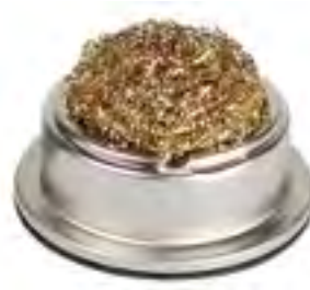
Copper Brillo Pad