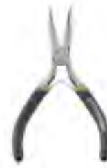
Small Needle Nose

Now that we have gather our tools and items and before we start let us look at this video I found that covers the beginning basics and some good tips on solders and even some de soldering.