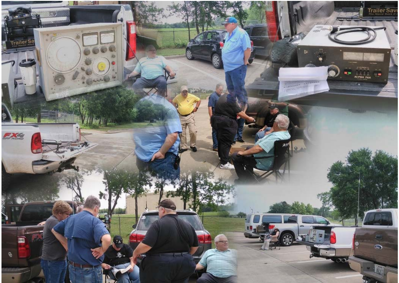
First LARA Swap Meet – April 29