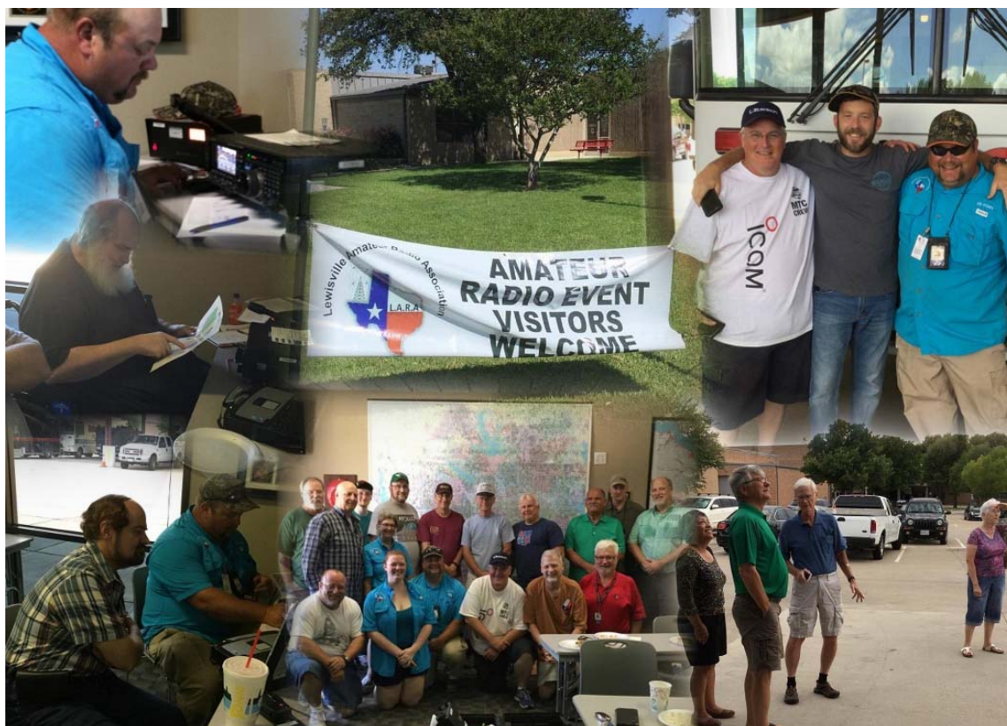
Field Day 2016

Further details will be published at a later date.